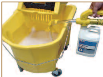
Bucket Fill (4 GPM)