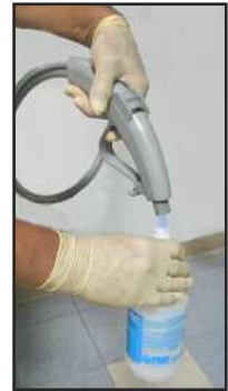
Easily fills small containers.