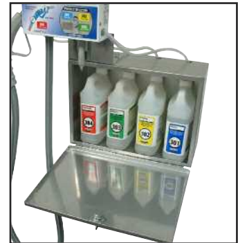
Easy chemical access