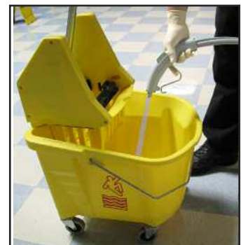
Simple bucket fill.