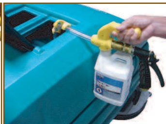
Auto Scrubber, Extractor & Pump Sprayer (4 GPM)