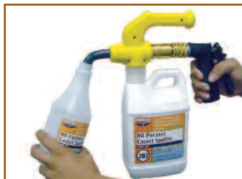
Secondary Bottle Fill (1 GPM)