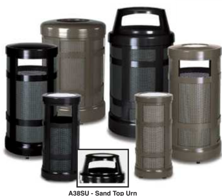
A38SU - Sand Top Urn

Available in many colors, sizes, and finishes by special order. See your Maintex sales representative for more information.