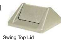
Swing Top Lid

Opening makes for easy disposal, peaked design is counter weighted and automatically closes to hide trash and reduces odors.