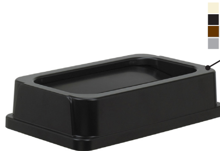
Drop Shot Lid

HANDS FREE Large opening is designed for high volume applications